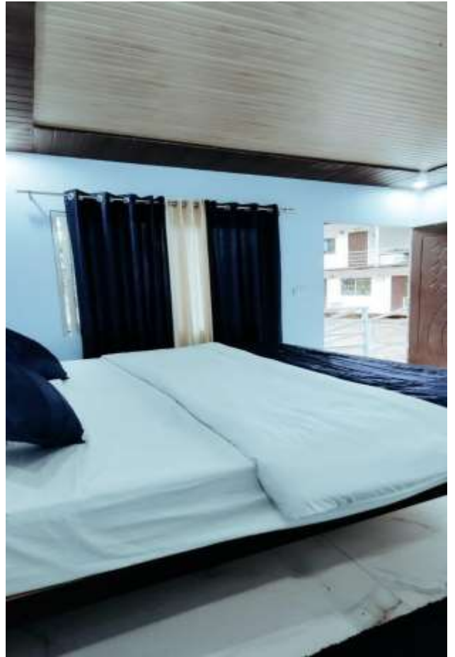
Musafir Resort, Guptakshi