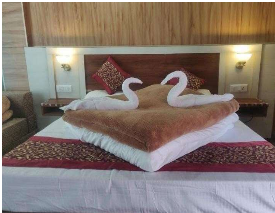
Hotel Anant, Badrinath